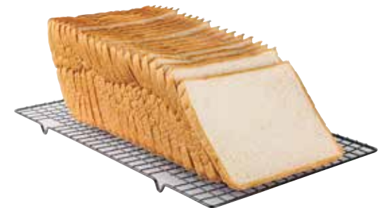
SUPER JUMBO BREAD WHITE Packing Type: Plastic Bag/LDPE Bag Net Weight: 1000gm Ingredients: Wheat flour, sugar,salt,yeast,bread improver,milkpowder,vegeable shortening