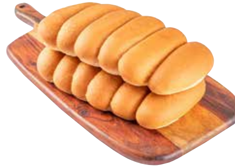
MINI SAMOON 12 PC Packing Type: Plastic Bag/LDPE Bag Net Weight: 150 gm Approx Ingredients: Wheat flour, sugar,salt,yeast,bread improver,milkpowder,vegeable shortening