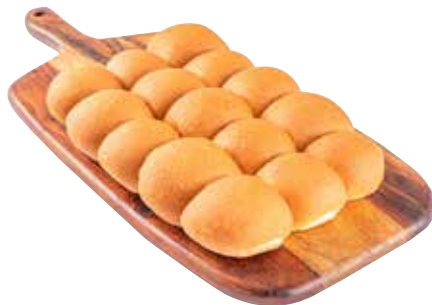
SOFT ROLL X 15PCS Packing Type: Plastic Bag/LDPE Bag Net Weight: 350 gm Approx Ingredients: Wheat flour, sugar,salt,yeast,bread improver,milkpowder,vegeable shortening