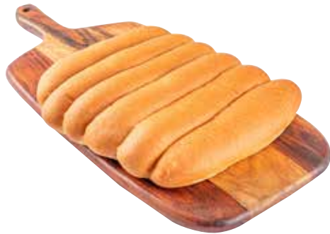
SAMOON X 6 PCS Packing Type: Plastic Bag/LDPE Bag Net Weight: 285 gm Approx Ingredients: Wheat flour, sugar,salt,yeast,bread improver,milkpowder,vegeable shortening