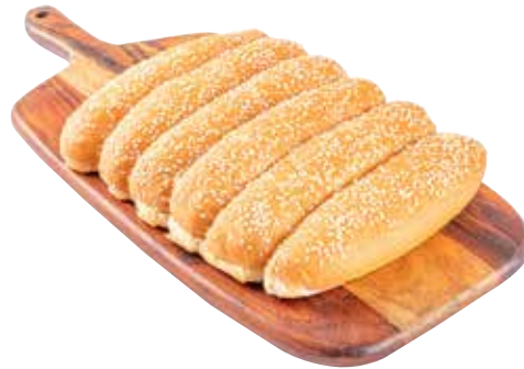
SESAME SAMOON x 6 PCS Packing Type: Plastic Bag/LDPE Bag Net Weight: 290 gm Approx Ingredients: Sugar,salt,yeast,bread improver,milkpowder,vegeable shortening,sesame seeds