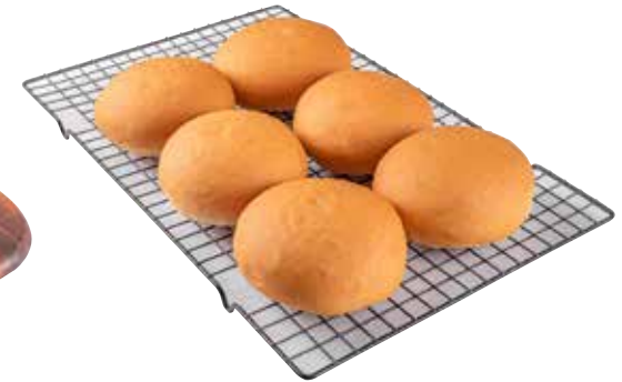
BURGER BREAD x 6PCS Packing Type: Plastic Bag/LDPE Bag Net Weight: 350 gm Approx Ingredients: Wheat flour, sugar,salt,yeast,bread improver,milkpowder,vegeable shortening