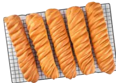
FRENCH VIENNOISE DEJEUNETTE x 5 Packing Type: Plastic Bag/LDPE Bag Net Weight: Ingredients: Wheat flour, sugar,salt,yeast,bread improver,milkpowder,vegeable shortening,butter