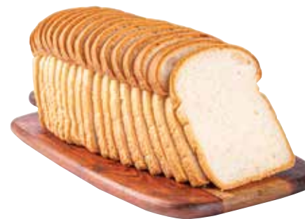
WHITE BREAD Packing Type: Plastic Bag/LDPE Bag Net Weight: 600gm Ingredients: Wheat flour, sugar,salt,yeast,bread improver,milkpowder,vegeable shortening